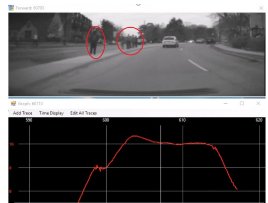
Figure 1: Example of Mobileye detection of pedestrian with video feed

Pedestrian-related corner cases were developed using an existing naturalistic driving study data – Safety Pilot Model Deployment (SPMD)<sup>2</sup>. In the SPMD study, about 140 vehicles were equipped with a variety of vehicle and environment sensors, and five cameras, among which one camera-based Mobileye system can automatically detect pedestrians in front of the vehicle, as shown in Figure 1 below: