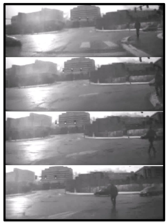
Figure 2: Roundabout blind spot (Left) and unexpected pedestrian crossing (Right)